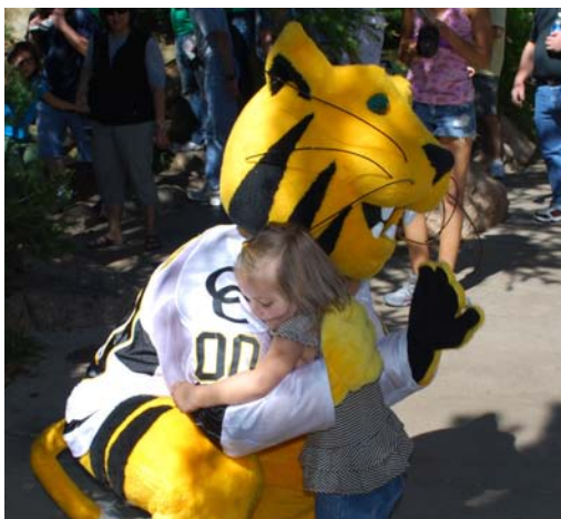
Prowler, Colorado College’s mascot made the Big Cat Bonanza extra special for kids.

Activities ranged far and wide. Children received Conservation Passports when they arrived and they then took them from station to station, learning about the cats through fun activities such as jumping, strength and endurance contexts, trivia games and more. Area dance troops performed animal inspired routines and the local college’s tiger mascot was on hand to provide some extra big cat fun! Kids even made enrichment items for the resident cats. Staff, docents and volunteers created an atmosphere of conservation awareness and inspired action in fun and memorable ways.