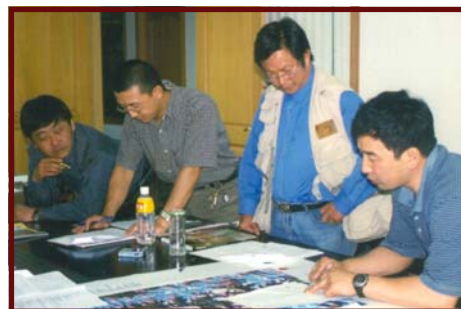
ISLT staff worked closely with scientists from the Kunming Institute to conduct surveys in the Meili Snow Mountains in yunnan, China.

ISLT staff led a training program in the Meili Snow Mountains of northwest Yunnan Province for scientists from the Kunming Institute of Zoology (KIZ) and other associates of The Nature Conservancy's (TNC) China Program. TNC has been working in partnership with government, local communities, and academic institutions for the past three years to help study and protect this area, one of the most biologically and culturally diverse landscapes on earth. ISLT helped to develop a wildlife database and to teach the Snow Leopard Information Management System (SLIMS) methodology so they can determine whether snow leopards are present in the Meili Snow Mountains.