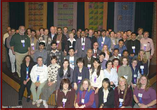
Participants in the 2002 Snow Leopard Survival Summit.

The most significant accomplishment of 2002 was the creation of the Snow Leopard Survival Strategy (SLSS). After being delayed due to the events of September 11, 2001, the SLSS was crafted during a summit meeting held in Seattle in May of 2002. Sixty-five conservation professionals from 17 different countries attended the workshop held at the Woodland Park Zoo. The participants worked hard over four days to identify and rank threats facing snow leopards in different areas of the cats' range, highlight potential actions to be taken to address these threats, and prioritize research and conservation initiatives.