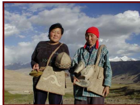
Snow Leopard Enterprises' expansion to the Kyrgyz Republic will make a real difference for the cats and the local people in this economically challenged country.

SLE was instituted in the Kyrgyz Republic in order to provide the families of protected area rangers an opportunity to increase their incomes in exchange for their assistance in anti-poaching efforts. Since the collapse of the former Soviet Union, the economic situation in the Kyrgyz Republic has become so poor that rangers are not being paid by the government to protect the wildlife in national parks. In order to make enough money to support their families, rangers are often forced to poach the very wildlife they are employed to protect. By offering these people an alternative source of income, we are working to reduce the levels of snow leopard and prey species loss due to illegal hunting.