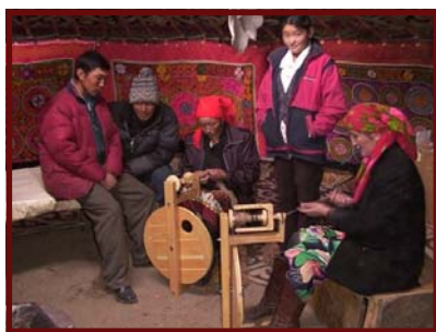
Snow Leopard Enterprises continues to grow and serve more and more rural families..

Snow Leopard Enterprises (SLE), ISLT's income generation/wildlife conservation project, continues to grow in Mongolia. Over 200 nomadic families are now taking part in the program and receiving additional income through handicraft production. Sales of SLE products in 2002 grew to more than $19,000 – up more than 700% over 2001 sales. SLE also took an important step towards becoming a self-sustaining program last year as ISLT staff worked with volunteers from the Seattle business community to develop a comprehensive business plan. By following the guidelines of the plan, we hope to have Snow Leopard Enterprises reach economic self-sufficiency by 2006. Indications are that poaching of snow leopard and prey species in the project areas is substantially reduced – a good sign for the cats!