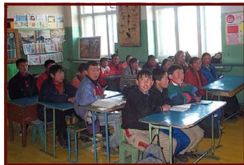
Peace Corps Mongolia continues to help educate school children in this important snow leopard range country.

ISLT and Peace Corps Mongolia continued their successful collaboration in 2002, as Peace Corps Volunteers worked hard to monitor snow leopard and prey species population densities and to train educators in the importance of including lessons on biodiversity and ecosystem health in their curricula. This partnership has proven to deliver cost-effective results over the past four years, and we look forward to continuing to work closely with Peace Corps.