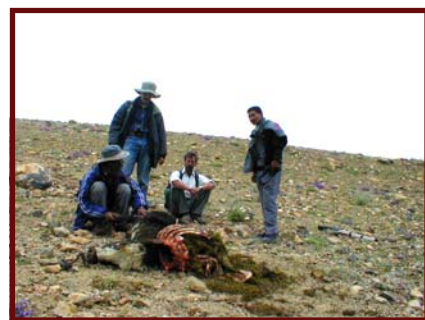
Livestock depredation and the resulting poaching of snow leopards continues to be a major problem in India.

Additionally, we are implementing a livestock insurance program. Participants pay premiums into a village-managed fund to insure their herds. If their animals are victims of predator attack, herders can file a claim and receive compensation for their loss. As an incentive for actively guarding their livestock against predation, herders who do not lose any animals in a given insurance period are refunded a portion of their premium.